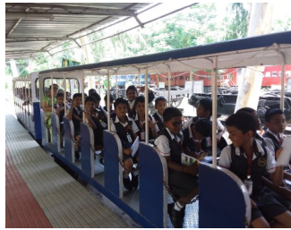
'Trip to Railway museum'