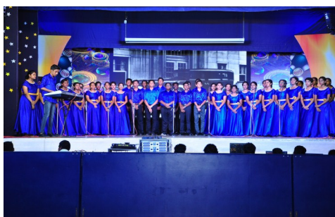
'High School Annual Day'