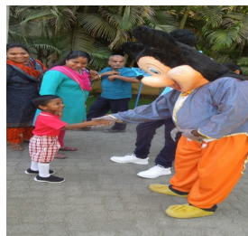
'Welcoming the Tiny Tots'